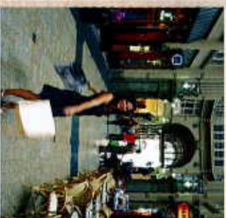
Leipzig – Mädler-Passage

Value for money is important for Germans, so the local gastronomy offers a wide choice of hearty home-made meals from 5,50 € to elaborate cross-over menus from 100,- € (mostly in Weimar, Erfurt or Leipzig). Be aware of the kitchen hours from 12 pm – 14 pm and again from 18 pm – 22 pm in most locations. Coffee and cakes "Kuchen" is your choice for afternoons. You won't regret it!