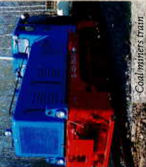
Coal miners' train