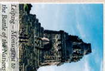
Leipzig – Monument to the Battle of the Nations

Goethe spent most of his life in Weimar, which in many ways represents German history. With 16 UNESCO sites it belongs on the top of your visitation list. Enter the houses of the great poets Goethe and Schiller, take a horse-drawn carriage through the lovely old town, take a walk in the parks and visit one of the many exhibitions, the beautifully restored Duchess Anna Amalia Library or the Bauhaus sites. The former concentration camp Buchenwald is now an important memorial.