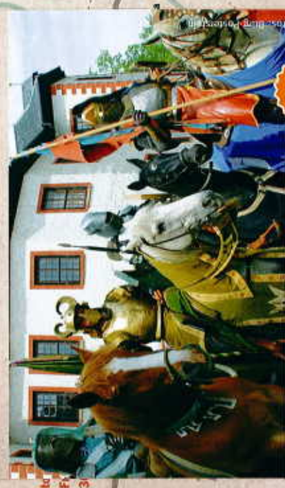
Mittelalterspektakel auf Burg Posterstein

Tue – Sat: 10 am – 5 pm, Sun: 10 am – 6 pm (Nov – Feb one hour shorter)