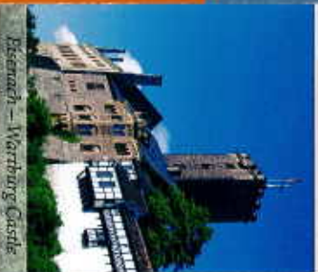
Eisenach – Wartburg Castle

UNESCO World Heritage Wartburg Castle is one of Germany's most famous and oldest castles. Important historic events at Wartburg Castle include the legendary medieval "Battle of the Bards" and the translation of the Bible by Martin Luther. You will be fascinated with magnificent rooms and the majestic setting. Today there are annual highlights such as concerts, exhibitions and a historic Christmas market.