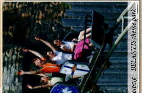
Leipzig – BELANTIS theme park

Parents and kids alike will love the Leipzig Zoo with its many natural habitats. In the Planetarium in the "City of Science" Jena the newest technology provides an astounding insight into space and spectacular shows. A ride with the coal miners train in Meuselwitz near Altenburg brings back past times as does the "Weltentor", a medieval game town. BELANTIS south of Leipzig is a fascinating theme park which illustrates entire continents, long past cultures and epochs just like an over