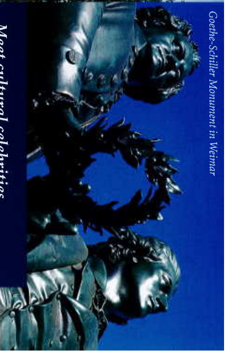
Goethe-Schiller Monument in Weimar

In Gotha visitors walk close to the history of the English Royal family. Friedenstein Castle is one of the largest Baroque complexes in Germany with the oldest standing Baroque theatre in the world.