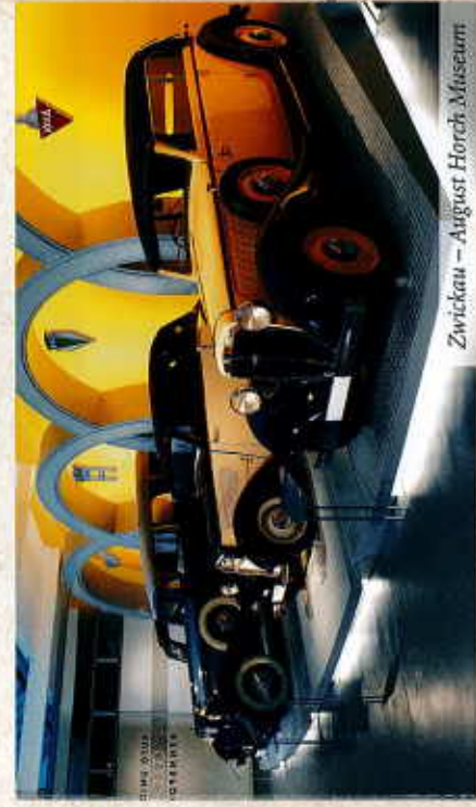
Zwickau – August Horch Museum

August Horch (lat.: Audi) was one of the founding fathers of Germany's car industry. The old Audi factory now houses the August Horch Automobile Museum of Zwickau. In a very entertaining way it documents cars of more than 100 years of automotive history. To get the "East experience" join a "Trabant" tour through Zwickau. Motorcycle Grand Prix races take place on the "Sachsenring" near Zwickau.