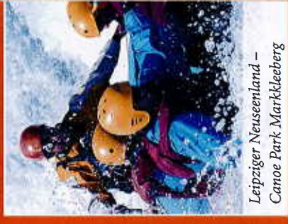
Leipziger Neuseenland – Canoe Park Markkleeberg

South of Leipzig a whole former coal mining area is being transformed into a breathtaking lake country. The newest attraction in the Leipziger Neuseenland is the white water slide in the Canoe park at the lake Markkleeberg. For beginners there are special rafting tours with a guide. Have a sunbather on the pier after a day of surfing at Cospudener See and bike back to Leipzig for a night of clubbing.