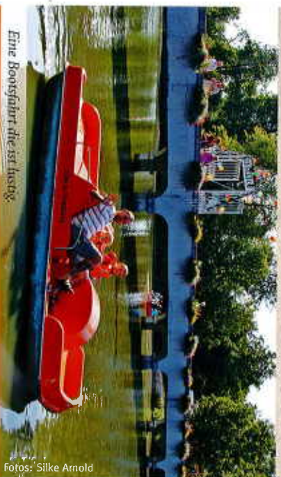
Eine Bootsfahrt über die Inselzug.